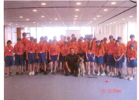
LVI Airport Police K-9 Demo

Interested boys and girls must submit applications no later than May 29, 2007. After this date names will be picked in according to the date received. If your name is selected you will be required to attend an orientation and interview with academy director prior to your acceptance. The academy for boys and girls will be held at the Plainfield Township Municipal Building at 6292 Sullivan Trail in Plainfield Township. Additional applications can be picked up at the Plainfield Township Police Headquarters or the Wind Gap Middle School.